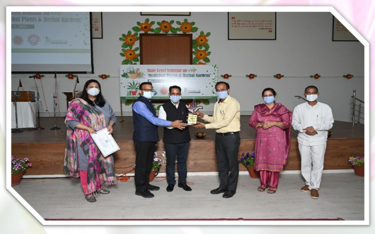
Momento distribution to teachers for their valuable contribution to the society

Finally, awards were distributed to the principals and in charges of the Eco Club for maintaining the Herbal Gardens.